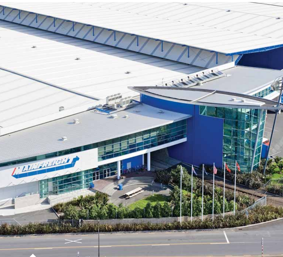
TOPGLASS® COLOUR: OPAL PROFILE: MAXISPAN® 2400 G/M 2